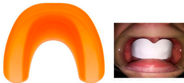
Figure 1. The Equilibrator Eptamed C3P orange and the Equilibrator C3P white in the oral cavity of the patient.

by their extreme simplicity in terms of their use by the patient, their safety, and their construction. Elastodontic devices allow the dentist to finalize the treatment and create a harmonious and natural smile obtained using comfortable and non-invasive appliances. The aim is to achieve balance in the oral cavity without creating problems in other areas of the body. All of this can be obtained by stimulating the patient to use their own strengths (tongue and chewing muscles) and enabling their natural growth and remodeling potential to solve the problem of malocclusion [4,5]. For this reason, it is also called an activator or equilibrator (EQ) device. In selecting the most suitable device for the individual patient, after taking alginate impressions and developing cast stone models, the orthodontist uses an appropriate ruler to measure the distance between the palatal cusps of the first upper bicuspid (or the first upper deciduous molars) and will then choose the correct size. Three different materials are available based on hardness: white in natural rubber (soft), and orange or mint in elastomeric resin (medium and hard, respectively). The patient inserts his or her teeth in the upper and lower splint fittings as shown in Figure 1. This device is functionalized through soft elastic forces, led by muscle energy, by biting into it. The activator is worn all night and for 1 h during the day [6].