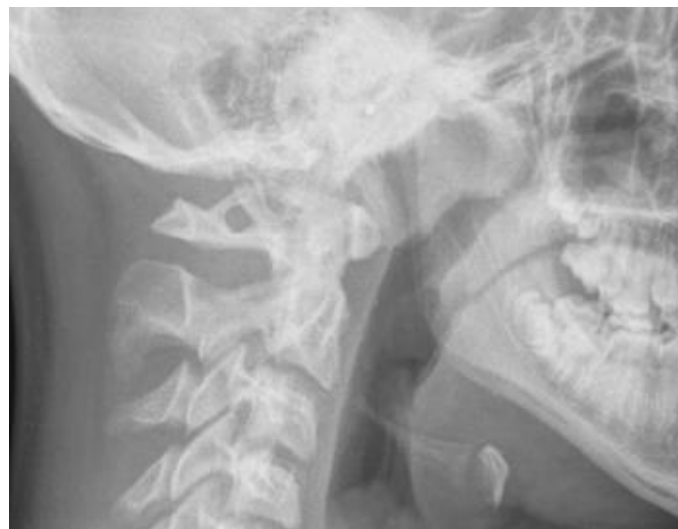
Figure 1. Ponticulus posticus (PP) full ring.

The evaluation of the sagittal length of the radiographic image of the atlas posterior arch was also made, so as to define its level of formation: fully formed or deficient.