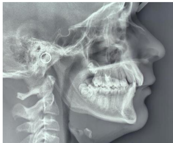
Figure 3. Deficient posterior atlas arch.

Sella turcica bridging measurement was performed measuring interclinoidal distance (from the upper portion of sella tuberculum to the sella turcica dorsum) and the greatest distance/diameter between the tip of sella turcica tuberculum and the posterior sellae contour.