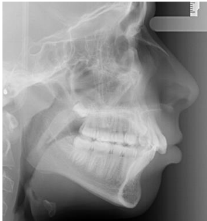
Figure 2. Full sella bridging.