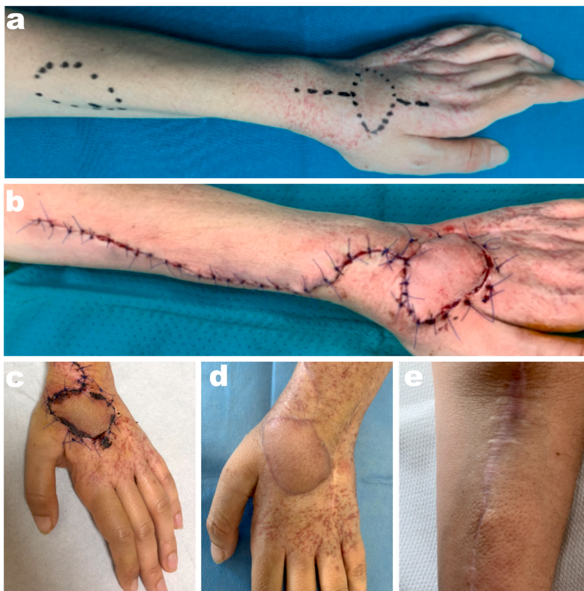
Fig. 1. a patient with a synovial sarcoma recurrence at the dorsum of the left hand, needing an RFAP distally pedicled to cover the oncological excision. (a) preop drawing; (b) immediate postop; (c) 2 weeks follow-up; flap (d) and donor site (e) at one-year follow-up.

Case two is a 64 years old male (Fig. 2) who was first seen by the