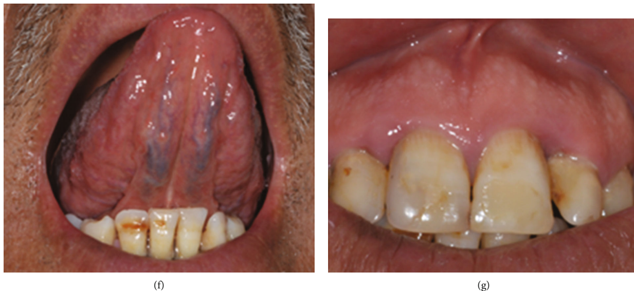
FIGURE 1: 59-year-old nonsmoker man. (a) Tongue. (b) Palate. (c) Right buccal mucosa. (d) Left buccal mucosa. (e) Orthopantomography showing moderate periodontitis associated to alveolar bone loss. (f) Inferior and (g) superior incisors showing minor enamel defects.

Furthermore, the patient will be planned for orthodontic treatment.