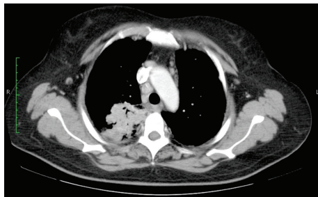
FIGURE 4: Computed tomography (CT) scan showing an irregular mass in the right lung field. This lesion was initially diagnosed as a cryptogenic organizing pneumonia.

Organization defined IMT as an intermediate soft tissue tumor that is composed of myofibroblast-differentiated spindle cells and accompanied by numerous inflammatory cells, plasma cells, and/or lymphocytes [1]. The term pseudotumor was coined because these lesions mimic expansive, invasive malignant tumors, both clinically and radiologically. Recently, the concept of IMT being a benign reactive lesion has been challenged owing to the clinical demonstration of recurrences as high as 37%, cytogenetic evidence of