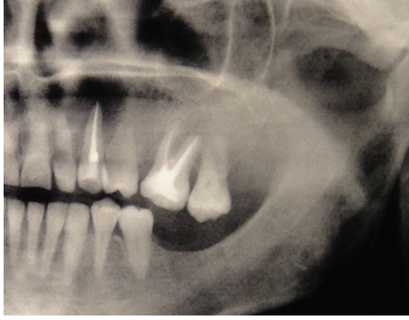
FIGURE 1: Panoramic radiograph revealing a radiolucency of about 2 cm of diameter in the periapical region of the endodontically treated left canine.