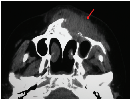
FIGURE 2: Axial CT image showing an infiltrative mass in the left maxillary region with destruction of the maxillary bone anteriorly wall, invading skin.

There was no medical history of note but a remarkable history of pneumonia surgically treated two years ago.