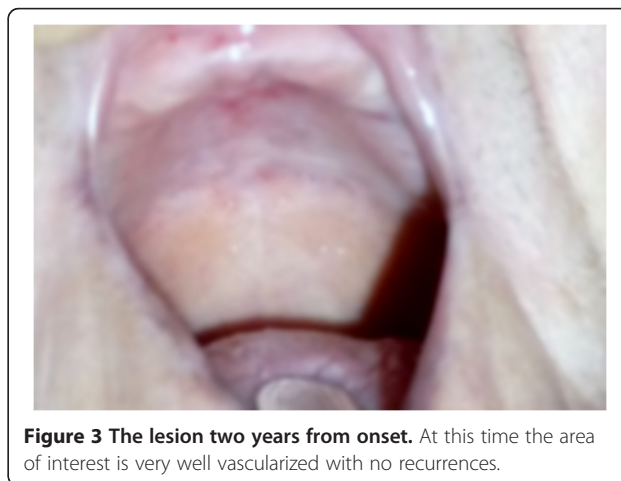
Figure 3 The lesion two years from onset. At this time the area of interest is very well vascularized with no recurrences.