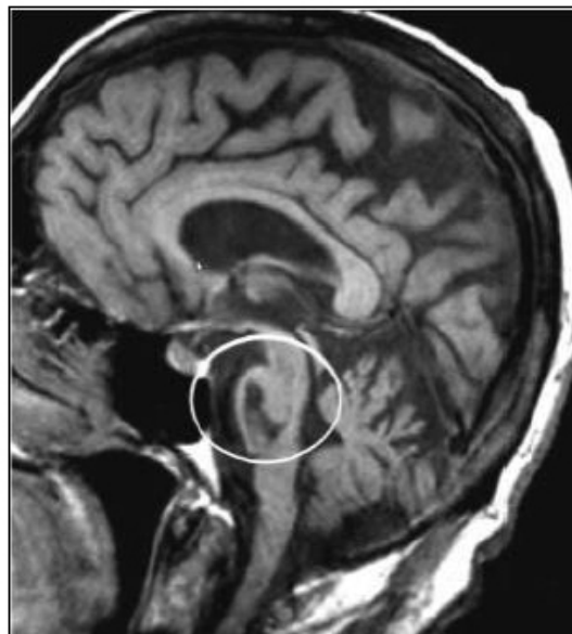
Fig. (1). Ventral brainstem lesion in locked-in syndrome.

Healthy volunteers matching patients for age, sex and education, free from neurological or psychiatric disorders and with normal MR imaging, were also included in the study.