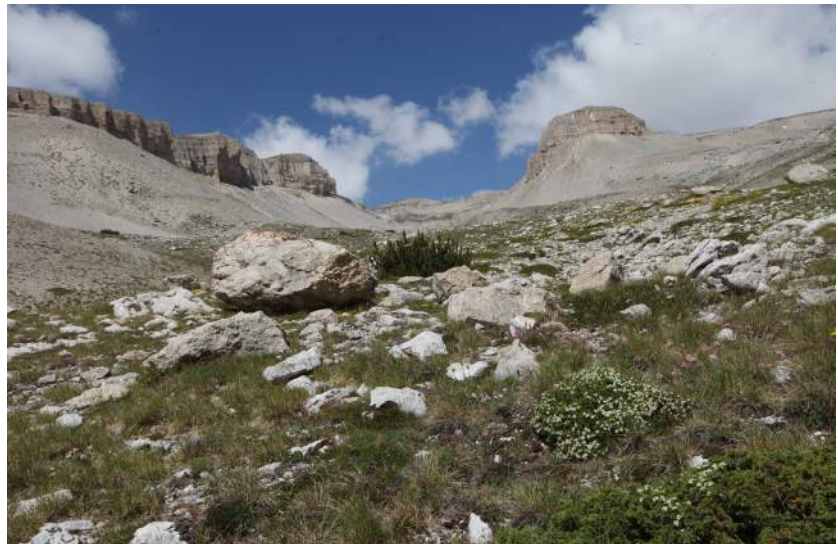
FIGURE 1. High part of Taranta Valley within the Majella National Park