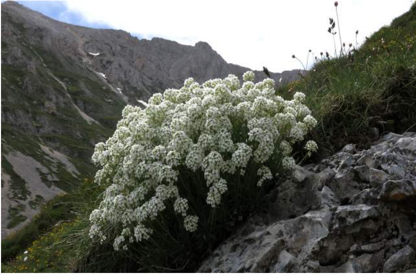
FIGURE 3. Phyllolepidum rupestre, endemic to Abruzzo Apennines

Phyllolepidum rupestre (Ten.) Trinajstic (Fig. 3), and Soldanella minima Hoppe subsp. samnitica Cristof. & Pignatti (Fig. 2).