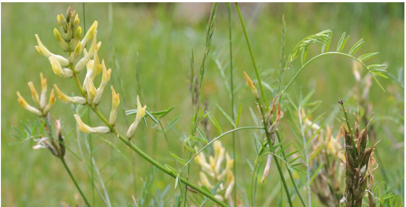
FIGURE 4. Astragalus aquilanus, endemic species of the central Apennines (Italy)

This rare Fabaceae species is endemic to the central Apennines (Italy), with few populations in Abruzzo. The single population reported from Calabria needs to be confirmed. Regarding the conservation status, Astragalus aquilanus (Fig. 4) is included in the Red List of the Italian flora as Endangered (Rossi et al., 2013). It is a priority species in Annex II of the Habitat Directive, is protected by regional laws (Abruzzo) n. 45/79 and n. 6/80 and is classified as 'category 0':