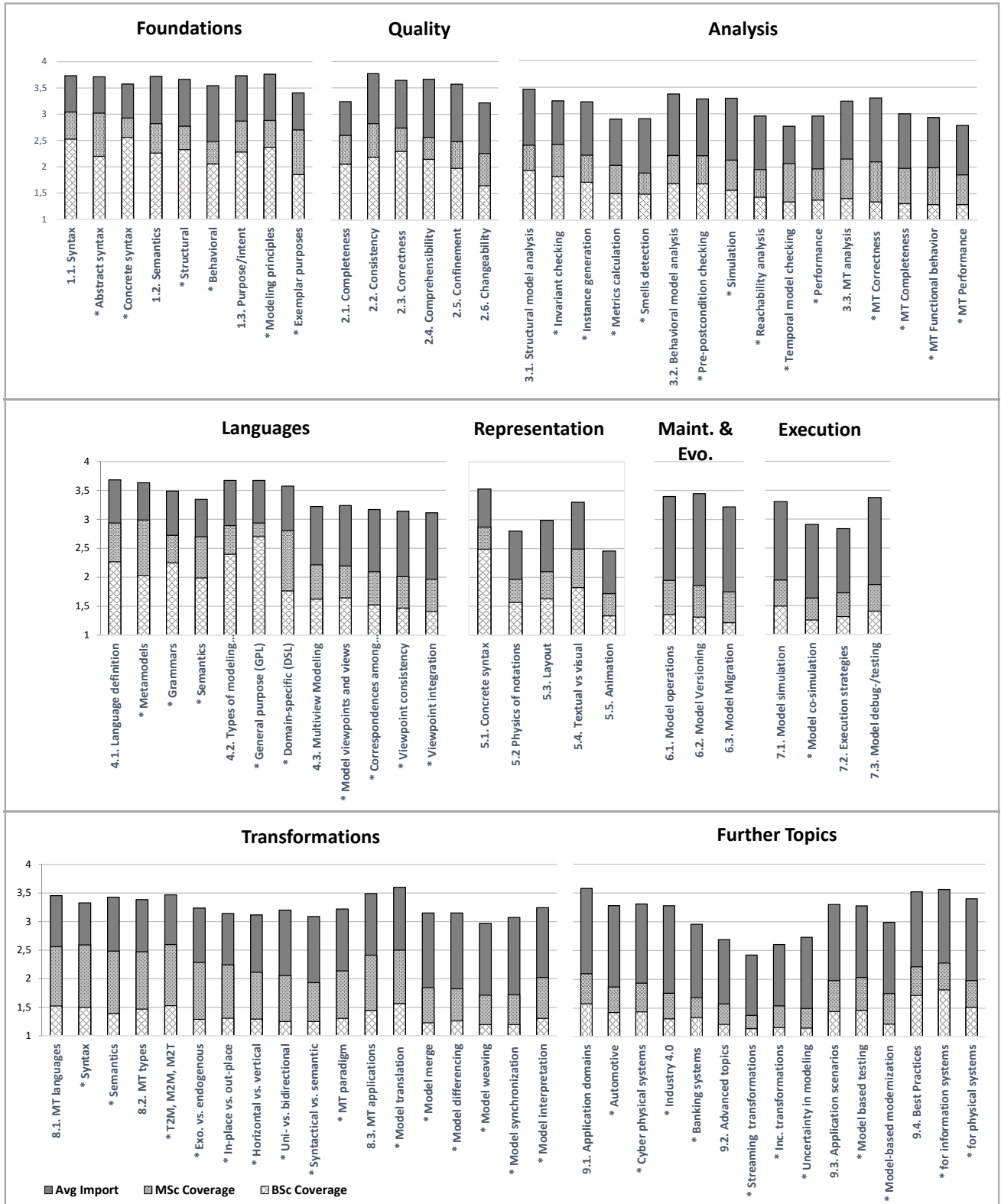
Fig. 4: Chart with the results of the survey.