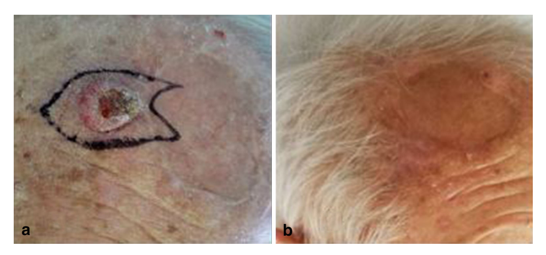
Fig. 1 Keratoacanthoma before treatment (a) showing a complete response after therapy (b)