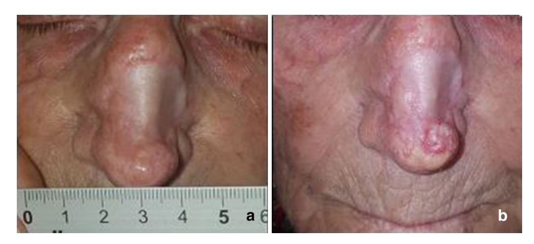
Fig. 2 Basal cell carcinoma before therapy (a) showing progression despite therapy (b)