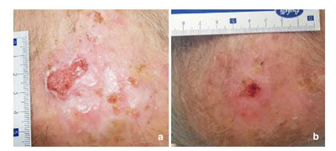
Fig. 3 Squamous cell carcinoma before therapy \left(a\right) showing a partial response to therapy \left(b\right)