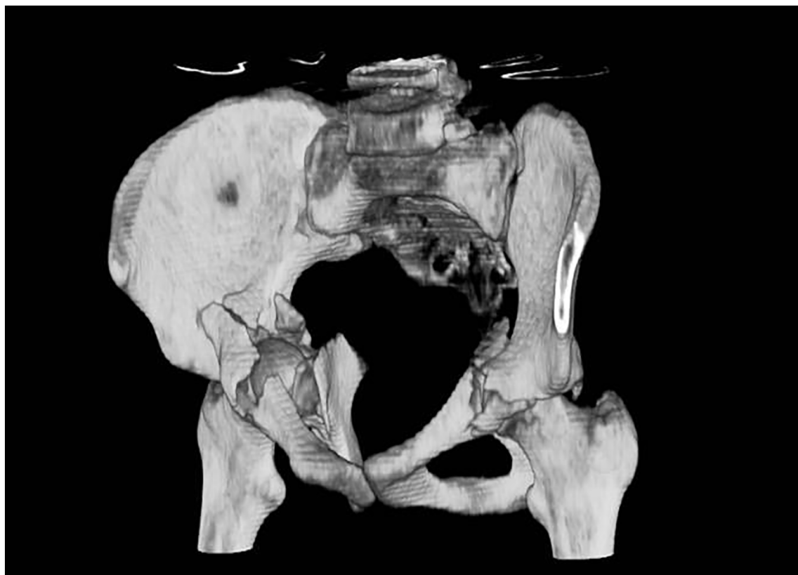
Fig. 2. The three dimensional reconstructed computed tomography gave us further details for planning the operation through intrapelvic and exopelvic vision.

Numeric Pain Rating Scale (NPRS), a segmented numeric version of the visual analog scale (VAS), used to assess pain intensity, reported a score of 5/10 (moderate pain) at the final follow-up. The last radiographic examination showed an adequate reduction of the fracture and a satisfactory wall and bone stock for a subsequent prosthesis: the patient developed a bilateral post-traumatic arthrosis with heterotopic calcifications typical of the underlying disease.