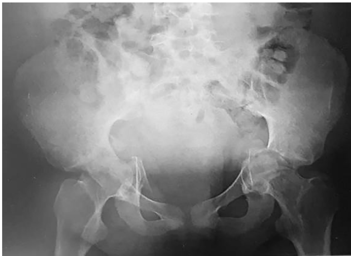
Fig. 1. The first X-ray show bilateral multifragmentary fracture of the acetabulum and protrusion of the femoral heads in the pelvis.

expresses the same phenotypic traits as her mother, who suffers from autosomal dominant OI. Following a fall from a chair during an epileptic seizure, the young patient came to our observation. Medical history did not predict any other fractures. She was not taking bisphosphonates before the injury but she was taking valproic acid for epilepsy.