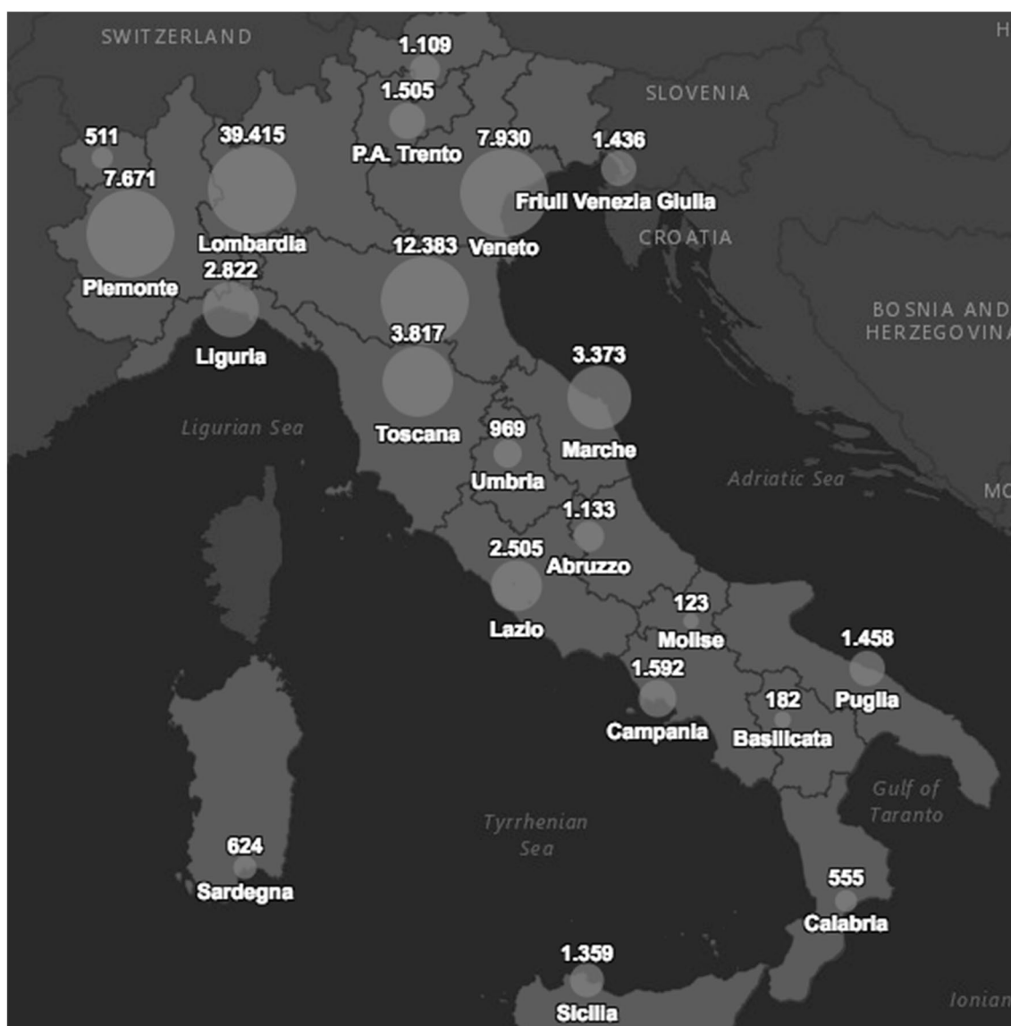
Fig. 1 Number of cases of SARS-CoV-2 infection detected in Italy on March 28, 2020, per region