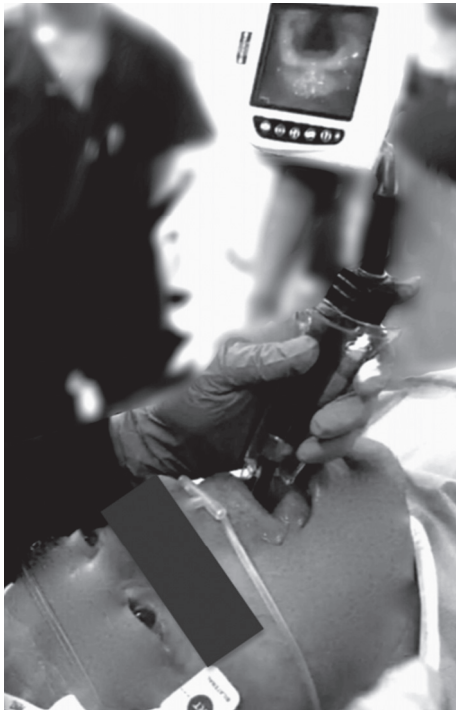
FIGURE 2: View of glottis with video laryngoscope (Glidescope®). The sedated patient under spontaneous breathing (Case 1).

maintaining the acquired ability over time. In some cases, moreover, the positioning of an endotracheal tube with the aid of the fibrobronchoscope is impossible due to limits of use linked to the instrument or to the particular anatomical condition of the patient. In recent years, use of the VLS has been increasing, and it is progressively becoming the preferred instrument for anaesthesiologists to perform difficult intubations, so as to dramatically modify both the practice of airway management and the very definition of difficult intubation [16]. It offers some undeniable advantages over the fibrobronchoscope, such as a wider view of the airways, which allows better viewing of nearby structures [17–19]; the absence of limitations in the diameter of the tube to be used, with the possibility of also positioning small-calibre tubes; and finally, the greater ease in changing the tracheal tube size, when it becomes necessary, while constantly maintaining a view of the airways [5].