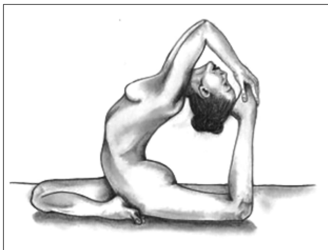
Fig 1: The yoga position so called "imperial pigeon" reached by the patient.